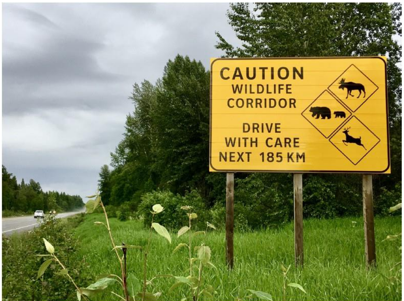
Figure 6) Example signage to affect motorist behaviour where unfenced highways bisect major wildlife travel corridors. British Columbia, Canada

Spatial threats to wildlife at this narrowed corridor are substantial without the additional stress of the 'wildlife-friendly' fence. Our data show that this area remains an active wildlife movement corridor. We also show that the 'wildlife-friendly' fence fails its mitigation purpose to allow unhindered wildlife movements through the WMA, whilst also failing its primary purpose of keeping livestock off the highway. We therefore recommend that the 'wildlife-friendly' fence be deactivated, and all fencing materials be removed as even downed wires pose an entanglement hazard to wildlife. In addition to fence removal, cattle grids could be installed over the highway at both tie-ins with the wildlife-proof fence (consistent with the design used at other wildlife corridor areas along the Trans-Kalahari highway) to limit livestock movement into the high-fence right-of-way. This could be done in combination with enhanced signage that educates motorists and encourages safer driver behavior (Figure 6). Although in practice all fence types fail to keep Kalahari highways livestock-free, there is even less reason to fence sections that bisect WMAs which have the least livestock numbers and pose the least risk of collisions.