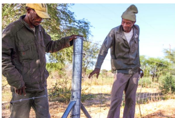
Figure 2) Relative height of the top barbed wire of the 'wildlife-friendly' fence (left) where it ties into the wildlife-proof fence (right)

The 'wildlife-friendly' fence between Kang and Hukuntsi spans 31.5 km. It does not extend completely across the WMA through which the highway passes, perhaps because several cattleposts have encroached into the eastern part of the WMA resulting in high livestock numbers there (Figure 1). The fence is comprised of three equally spaced barbed wires, the top wire 80 cm above ground level, although varying in height with micro-topography. Both sides of the highway right-of-way are fenced, 60 metres apart. The 'wildlife-friendly' fence ends where it ties into a wildlife-proof fence comprised of 125 cm high page wire plus a single barbed wire above at height 140 cm (Figure 2). The wildlife-proof fence continues along both sides of the highway east and west to Kang and Hukuntsi respectively. Directly north of the Kang-Hukuntsi highway at a varying distance of 120 m to 2.7 km lies the old Kang-Hukuntsi Road. It is a straight narrow sand track that no longer receives traffic. This linear feature conveniently served as a control transect paralleling the 'wildlife-friendly' fence (Figure 1).