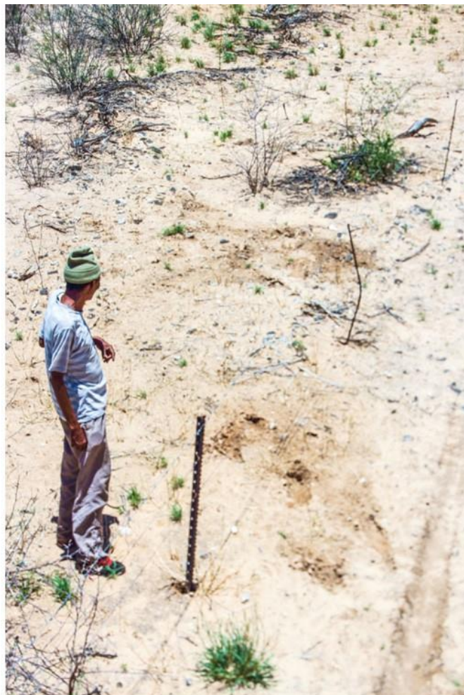
Figure 5) Master Tracker NK showing where a hartebeest contacted the 'wildlife-friendly' fence at a fast gallop, bending a metal dropper and falling turned 180 degrees on the other side