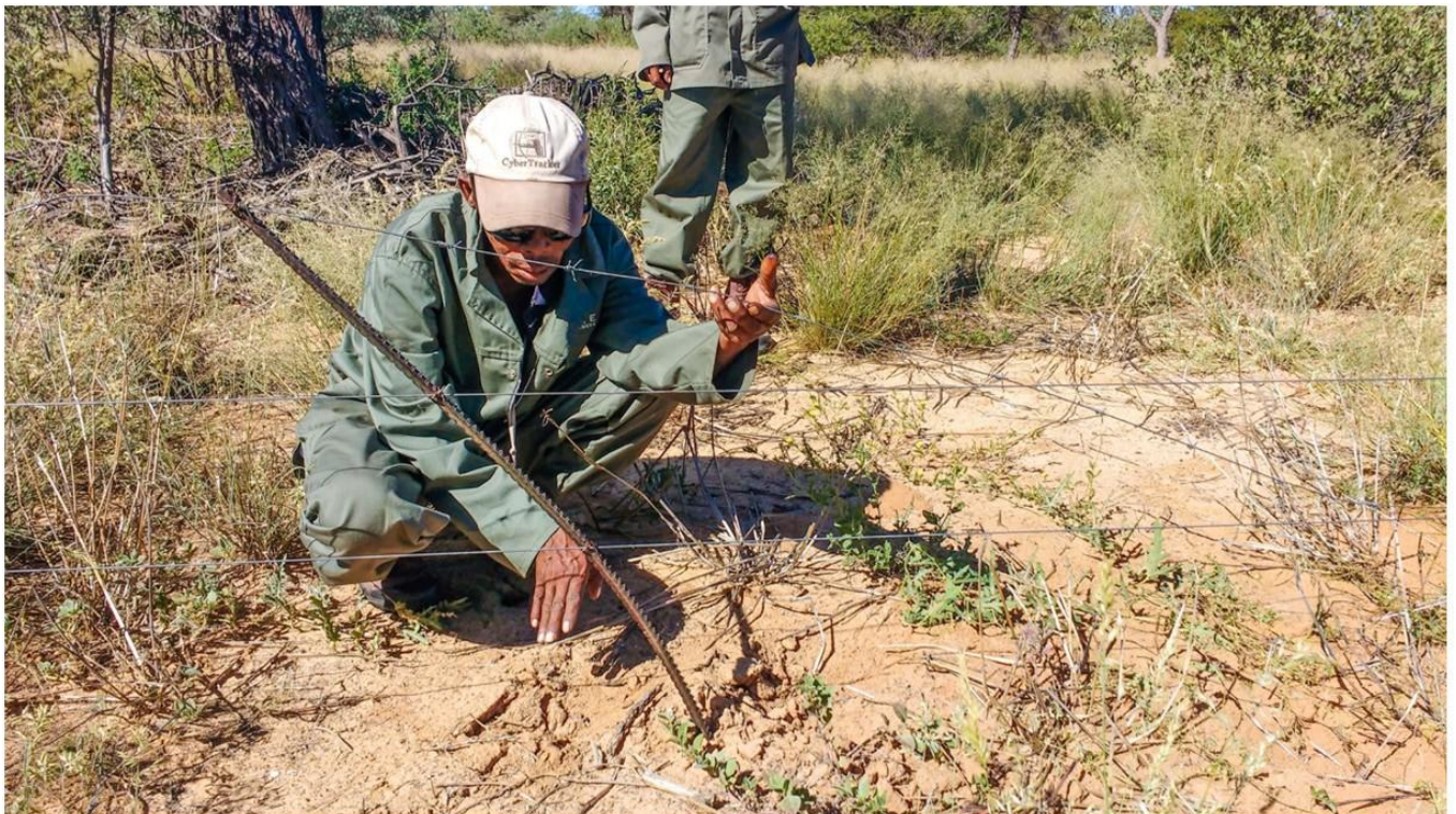
Figure 3) Master Tracker HL indicating where a gemsbok contacted the 'wildlife-friendly' fence, bending the metal dropper and damaging the top wire