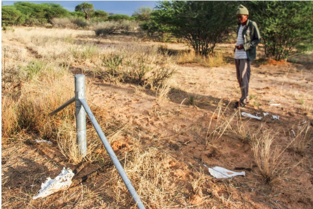
Figure 4) Remains of a gemsbok killed upon impact with a stabilizing fence post along the 'wildlife-friendly' fence